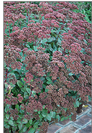
Matrona Stonecrop flowers

Matrona Stonecrop is recommended for the following landscape applications;