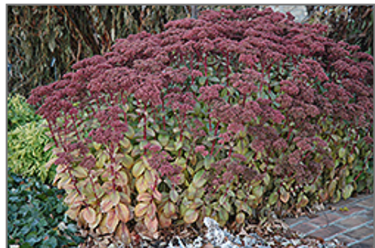
Matrona Stonecrop in fall