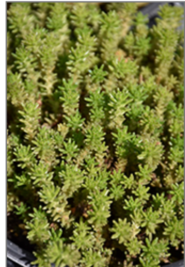
Six Row Stonecrop foliage

Six Row Stonecrop is a fine choice for the garden, but it is also a good selection for planting in outdoor pots and containers. Because of its spreading habit of growth, it is ideally suited for use as a 'spiller' in the 'spiller-thriller-filler' container combination; plant it near the edges where it can spill gracefully over the pot. Note that when growing plants in outdoor containers and baskets, they may require more frequent waterings than they would in the yard or garden. Be aware that in our climate, most plants cannot be expected to survive the winter if left in containers outdoors, and this plant is no exception. Contact our experts for more information on how to protect it over the winter months.