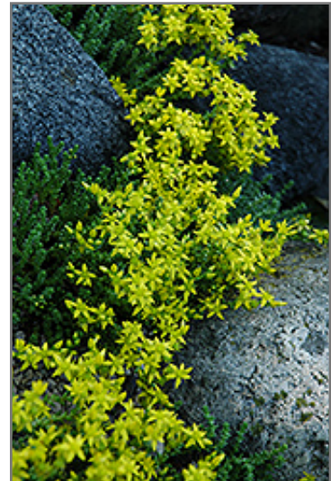
Six Row Stonecrop flowers