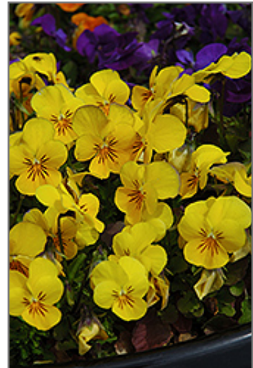
Penny Yellow Pansy flowers

Penny Yellow Pansy is an herbaceous perennial with a mounded form. Its relatively fine texture sets it apart from other garden plants with less refined foliage.