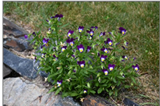
Johnny Jump-Up in bloom

Johnny Jump-Up will grow to be only 4 inches tall at maturity extending to 6 inches tall with the flowers, with a spread of 6 inches. When grown in masses or used as a bedding plant, individual plants should be spaced approximately 5 inches apart. It grows at a fast rate, and tends to be biennial, meaning that it puts on vegetative growth the first year, flowers the second, and then dies. However, this species tends to self-seed and will thereby endure for years in the garden if allowed. As an herbaceous perennial, this plant will usually die back to the crown each winter, and will regrow from the base each spring. Be careful not to disturb the crown in late winter when it may not be readily seen!