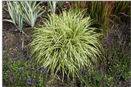
Evergold Variegated Japanese Sedge foliage

Evergold Variegated Japanese Sedge is a fine choice for the garden, but it is also a good selection for planting in outdoor pots and containers. It is often used as a 'filler' in the 'spiller-thriller-filler' container combination, providing a canvas of foliage against which the thriller plants stand out. Note that when growing plants in outdoor containers and baskets, they may require more frequent waterings than they would in the yard or garden. Be aware that in our climate, most plants cannot be expected to survive the winter if left in containers outdoors, and this plant is no exception. Contact our experts for more information on how to protect it over the winter months.