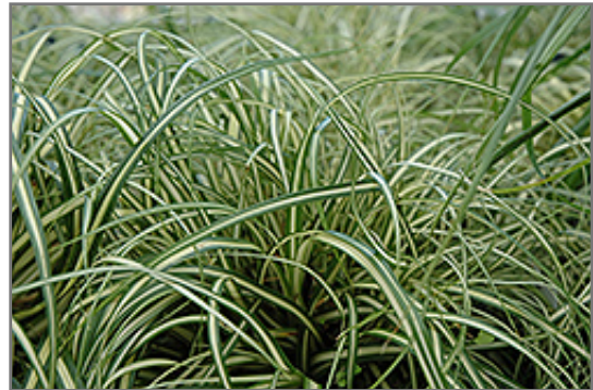
Evergold Variegated Japanese Sedge foliage

This is a relatively low maintenance plant, and is best cleaned up in early spring before it resumes active growth for the season. It has no significant negative characteristics.