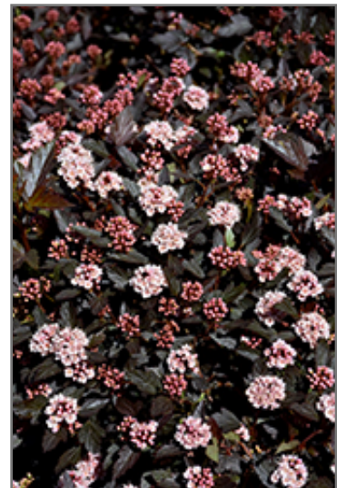
Little Joker Ninebark flowers