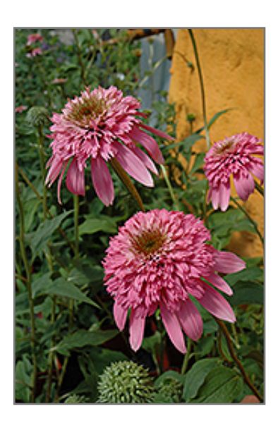
Razzmatazz Coneflower flowers

Stunning double pompom coneflowers are presented on these sturdy, well branched plants; bright magenta-purple petals surround a lovely rosy-pink central pompom, rising above green pointy foliage; excellent in borders, beds and containers; great cut flower