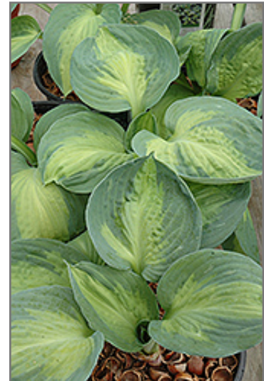
Adrian's Glory Hosta foliage