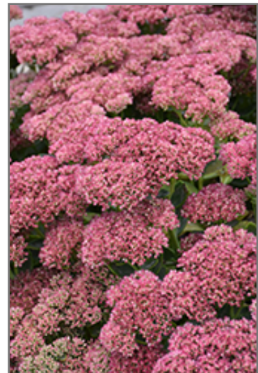
Autumn Fire Stonecrop flowers