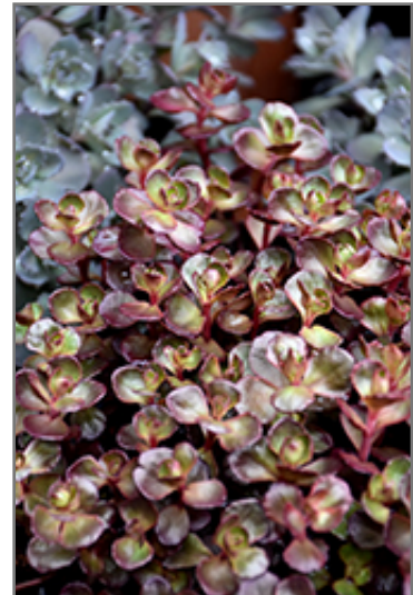
Voodoo Stonecrop foliage

Voodoo Stonecrop is recommended for the following landscape applications;