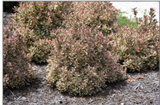
My Monet Weigela

* This is a 'special order' plant - contact store for details