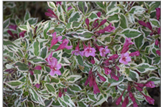
My Monet Weigela flowers

My Monet Weigela is recommended for the following landscape applications;