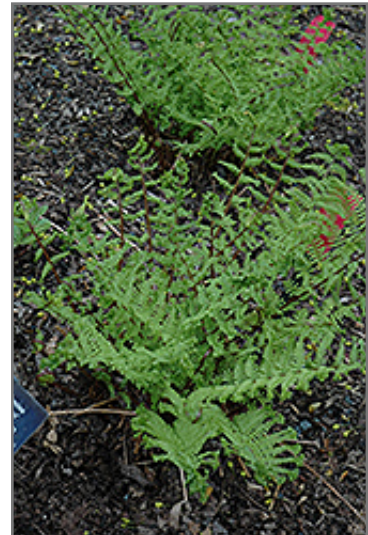
Lady Fern foliage