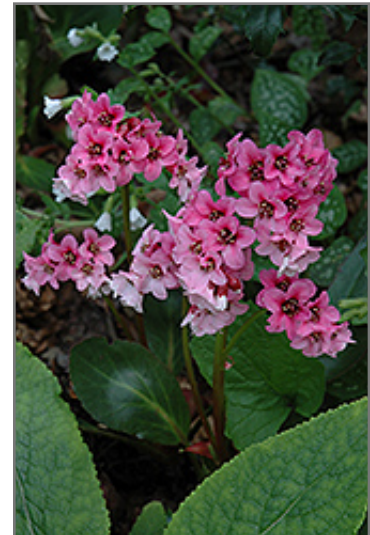
Pink Dragonfly Bergenia flowers

Pink Dragonfly Bergenia is recommended for the following landscape applications;