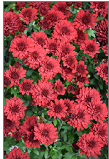
Five Alarm Red Chrysanthemum flowers