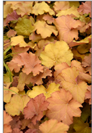
Caramel Coral Bells foliage

This is a relatively low maintenance plant, and should be cut back in late fall in preparation for winter. It is a good choice for attracting hummingbirds to your yard. It has no significant negative characteristics.