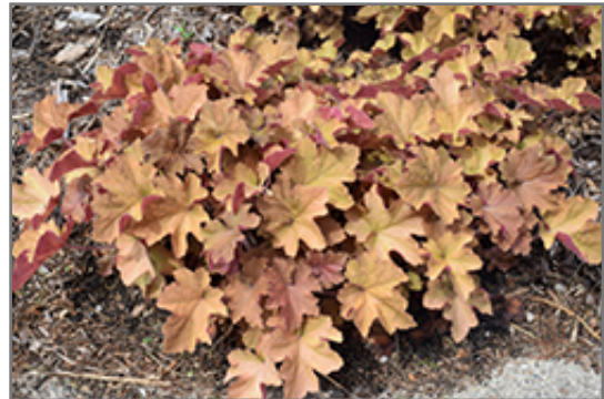
Caramel Coral Bells

Caramel Coral Bells will grow to be about 10 inches tall at maturity extending to 18 inches tall with the flowers, with a spread of 18 inches. When grown in masses or used as a bedding plant, individual plants should be spaced approximately 15 inches apart. Its foliage tends to remain low and dense right to the ground. It grows at a medium rate, and under ideal conditions can be expected to live for approximately 10 years. As an evergreen perennial, this plant will typically keep its form and foliage year-round.