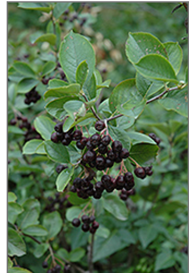
Black Chokeberry fruit