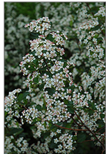
Black Chokeberry flowers