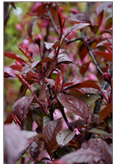
Perfect Purple Flowering Crab foliage