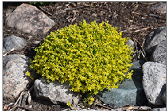
Golden Moss Stonecrop in bloom

Golden Moss Stonecrop is recommended for the following landscape applications;