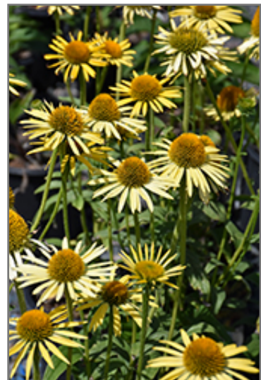
Maui Sunshine Coneflower flowers