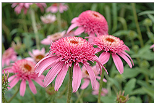
Cone-fections Pink Double Delight Coneflower flowers

This is a relatively low maintenance plant, and is best cleaned up in early spring before it resumes active growth for the season. It is a good choice for attracting butterflies to your yard, but is not particularly attractive to deer who tend to leave it alone in favor of tastier treats. It has no significant negative characteristics.