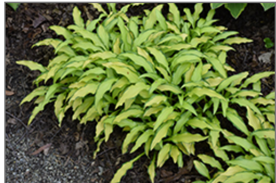
Kabitan Hosta