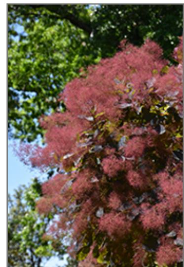
Grace Smokebush flowers