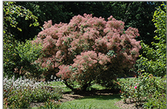
Grace Smokebush in bloom

This shrub will require occasional maintenance and upkeep, and is best pruned in late winter once the threat of extreme cold has passed. Deer don't particularly care for this plant and will usually leave it alone in favor of tastier treats. It has no significant negative characteristics.