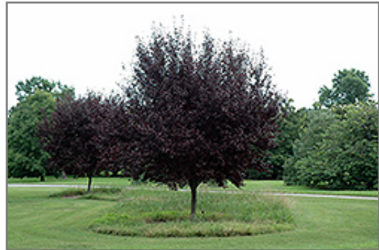
Krauter Vesuvius Plum

* This is a 'special order' plant - contact store for details