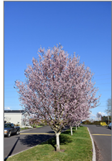
Krauter Vesuvius Plum in bloom

Krauter Vesuvius Plum is a deciduous tree with an upright spreading habit of growth. Its average texture blends into the landscape, but can be balanced by one or two finer or coarser trees or shrubs for an effective composition.