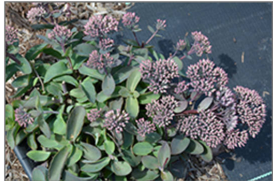
Chocolate Drop Stonecrop flower buds