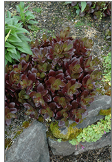
Chocolate Drop Stonecrop

Chocolate Drop Stonecrop is a dense herbaceous perennial with an upright spreading habit of growth. Its relatively coarse texture can be used to stand it apart from other garden plants with finer foliage.