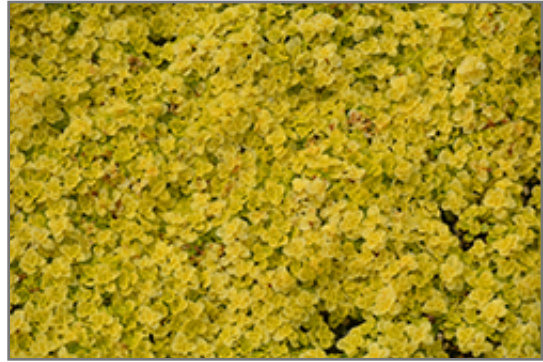
Golden Stonecrop foliage

Golden Stonecrop is recommended for the following landscape applications;