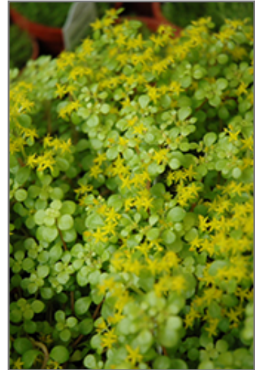
Golden Stonecrop flowers

This plant is not reliably hardy in most areas of east Idaho. Please contact us for more information.