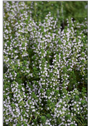
Doone Valley Thyme flowers

Doone Valley Thyme is a dense herbaceous evergreen perennial with a ground-hugging habit of growth. It brings an extremely fine and delicate texture to the garden composition and should be used to full effect.