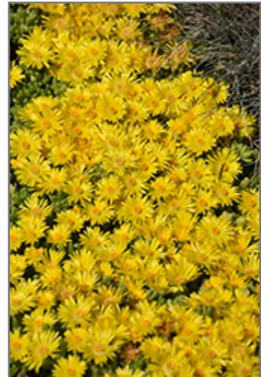
Yellow Ice Plant flowers

Yellow Ice Plant is recommended for the following landscape applications;