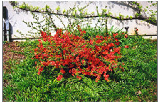
Common Flowering Quince in bloom

Common Flowering Quince is a dense multi-stemmed deciduous shrub with a more or less rounded form. Its average texture blends into the landscape, but can be balanced by one or two finer or coarser trees or shrubs for an effective composition.