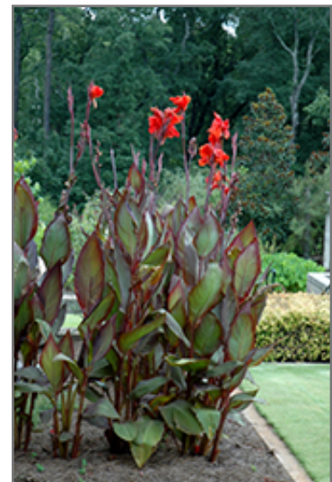
Australia Canna in bloom