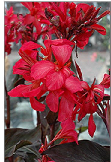
Australia Canna flowers

This plant should only be grown in full sunlight. It requires an evenly moist well-drained soil for optimal growth, but will die in standing water. It is not particular as to soil pH, but grows best in rich soils. It is highly tolerant of urban pollution and will even thrive in inner city environments, and will benefit from being planted in a relatively sheltered location. Consider applying a thick mulch around the root zone in winter to protect it in exposed locations or colder microclimates. This particular variety is an interspecific hybrid. It can be propagated by division; however, as a cultivated variety, be aware that it may be subject to certain restrictions or prohibitions on propagation.