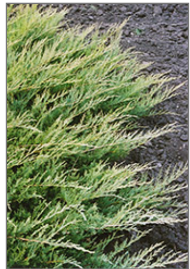
Broadmoor Juniper foliage