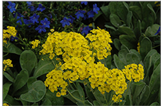
Basket Of Gold Alyssum flowers

Basket Of Gold Alyssum is recommended for the following landscape applications;