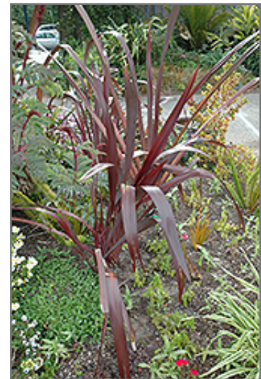
Amazing Red New Zealand Flax foliage